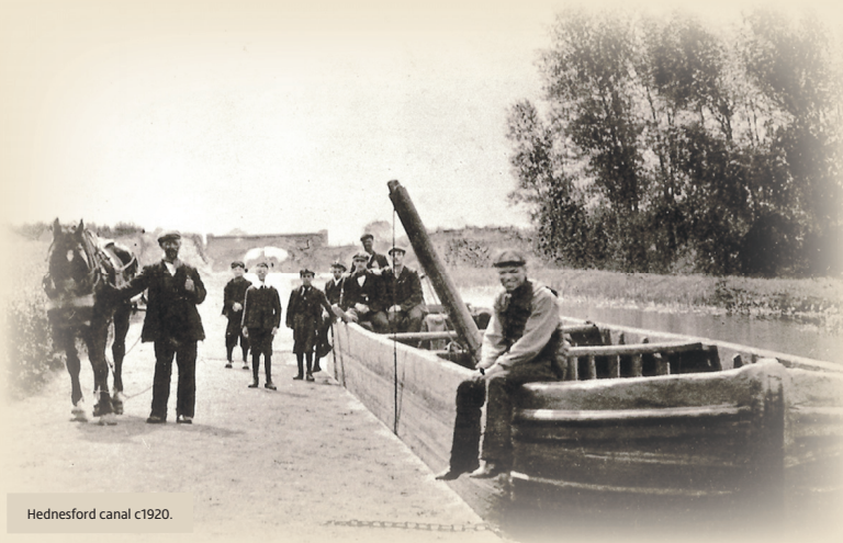
Hednesford canal c1920.