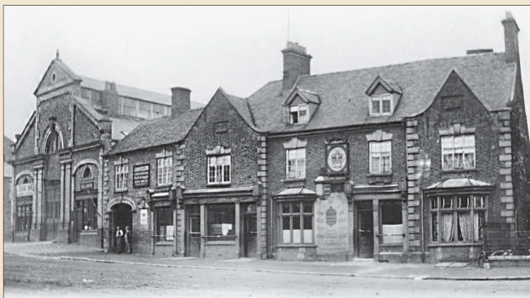
This photograph above dates from about 1910-1920. On the right is the Crown Hotel. On the left is the old market hall, built in 1869. They were situated in Market Place, Cannock. Both were demolished in the early 1960s to make way for a row of modern shops.