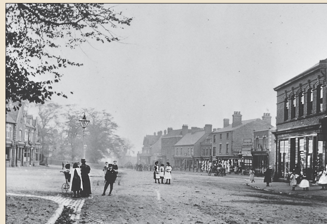
Cannock town centre, looking south. This image probably dates from the early 1900s.