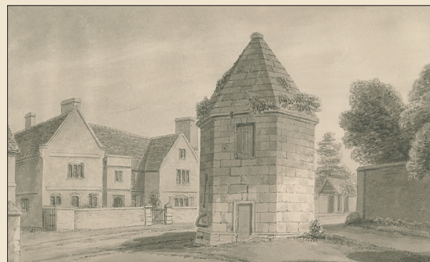
The Conduit Head by J Buckler, 1841. This hexagonal building was the outlet for Cannock's drinking water, flowing from here to pumps situated around the town. By 1864 there were six pumps in Cannock.