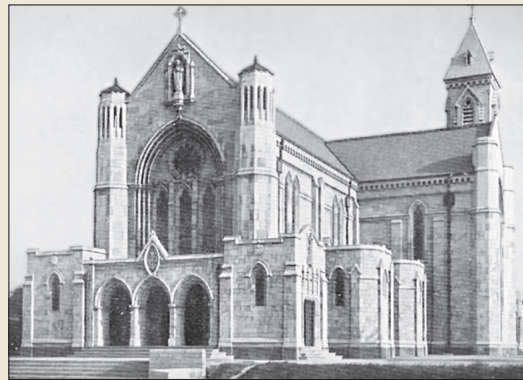
A postcard of Our Lady of Lourdes c1935. The life-size statue of Our Lady, near the top of the building, is carved from Portland Stone.