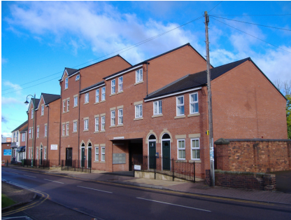
Fig.2 New development adjacent to Conservation Area seeking to pick up traditional character through design, materials, siting and scale