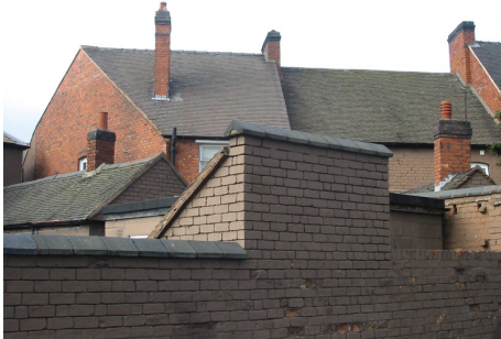
Fig. 1 Features typical of the Conservation Area vulnerable to removal and decay: boundary walls, traditional roof tiles, chimneys, rear outbuildings, paving