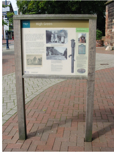
Fig.2 : The public realm - well designed signage and paving, well located street furniture sited close to existing structures and poorly located utility cabinet 'clutter' standing alone