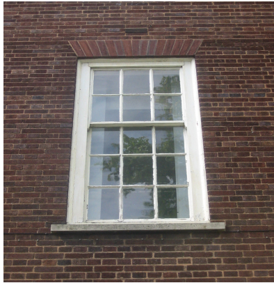
Fig. 1: Features typical of the Conservation Area vulnerable to removal and decay: timber windows, architectural details, historic shopfronts