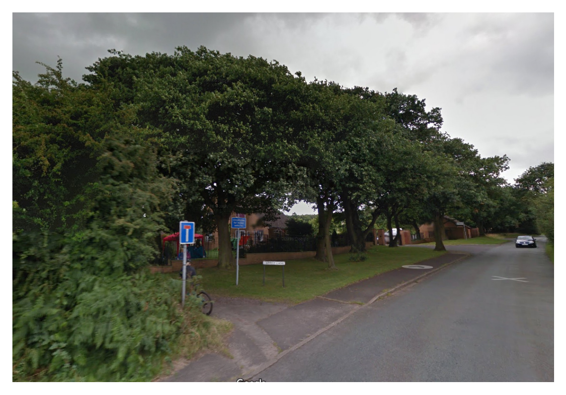
Above – Street view approaching from the north of Stile Cop Road