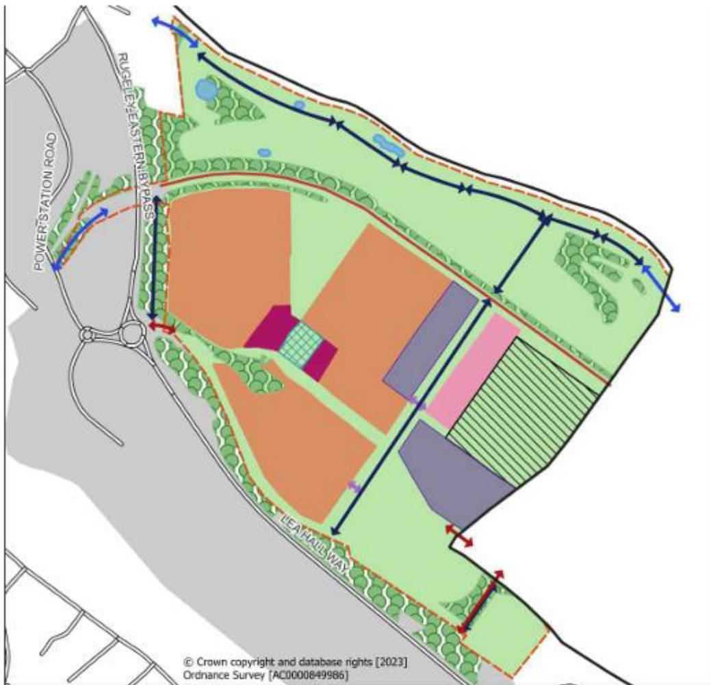
Figure 1 Concept Diagram (Cannock Chase Local Plan Pre Submission Reg. 19, Policy SM1)