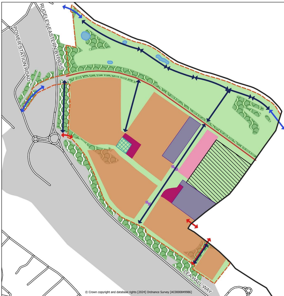
Figure 2 Agreed proposed replacement concept diagram